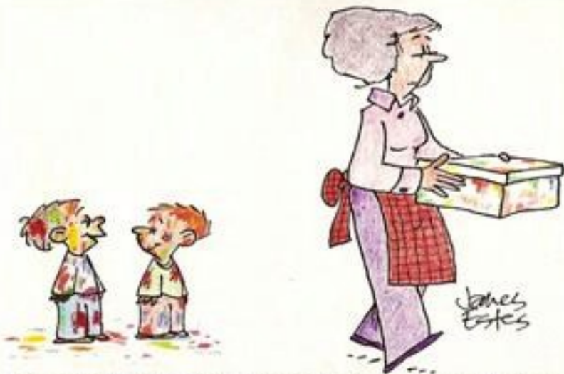
"Gran thinks that putting away the finger paints will keep us from making a mess. Gran sure has a lot to learn."