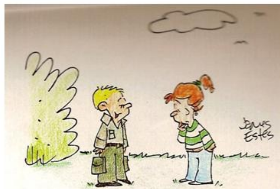
"They're called 'cargo pants.' They're for carrying cargo ... like frogs and snakes and bugs."