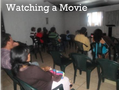
Watching a Movie