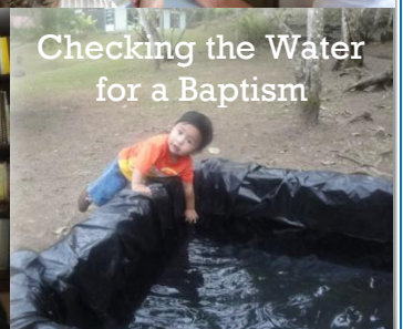
Checking the Water for a Baptism