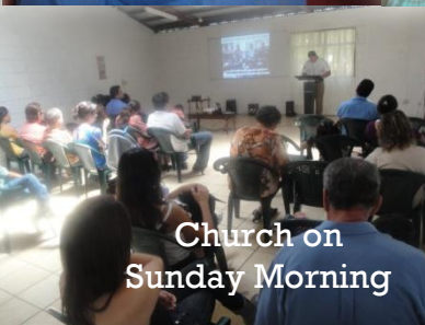
Church on Sunday Morning