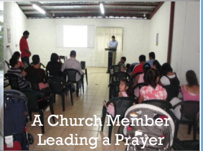
A Church Member Leading a Prayer