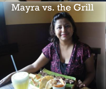
Mayra vs. the Grill