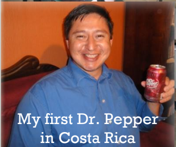
My first Dr. Pepper in Costa Rica