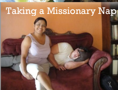
Taking a Missionary Nap